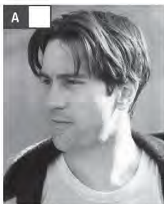
Robert De Niro